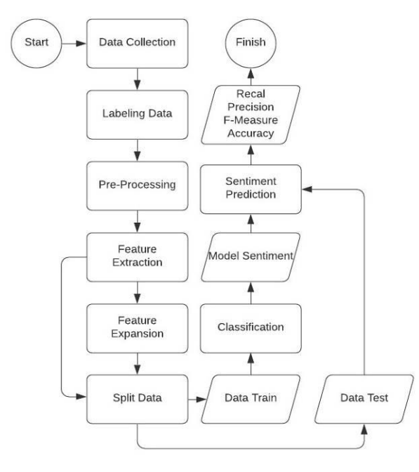
Figure 1. System Architecture